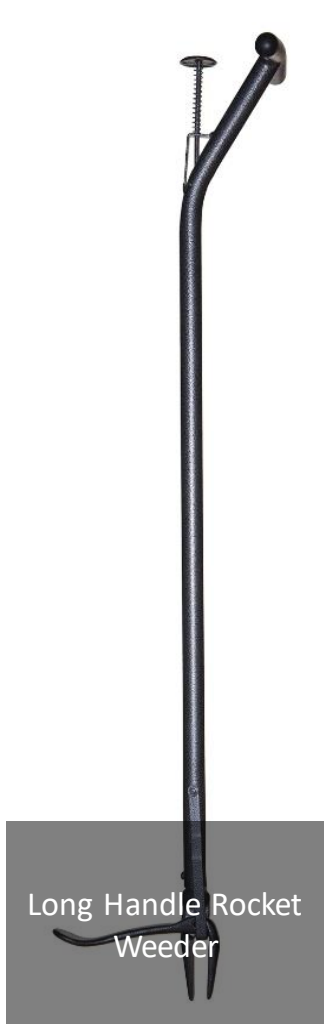
Long Handle Rocket Weeder