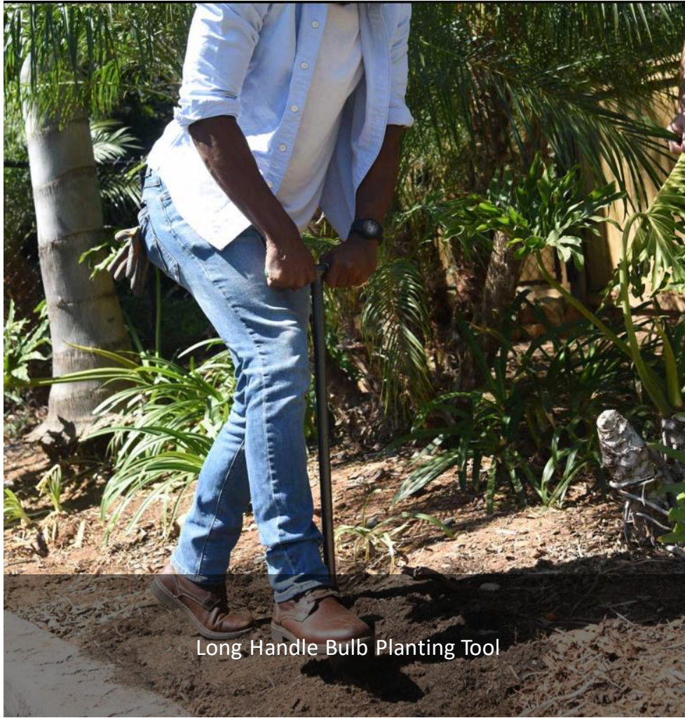
Long Handle Bulb Planting Tool